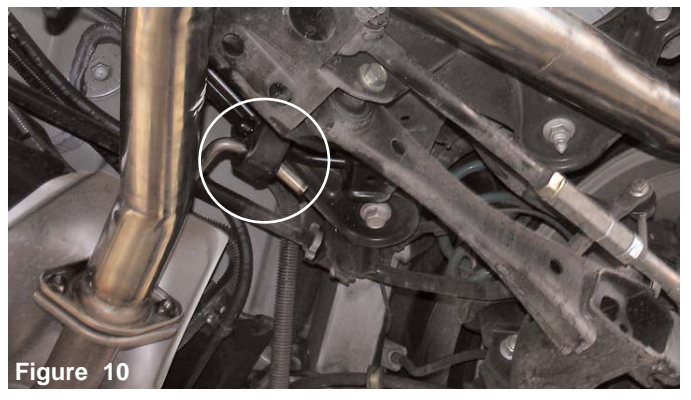
Insert hanger located by the flange into the rear hanging grommet