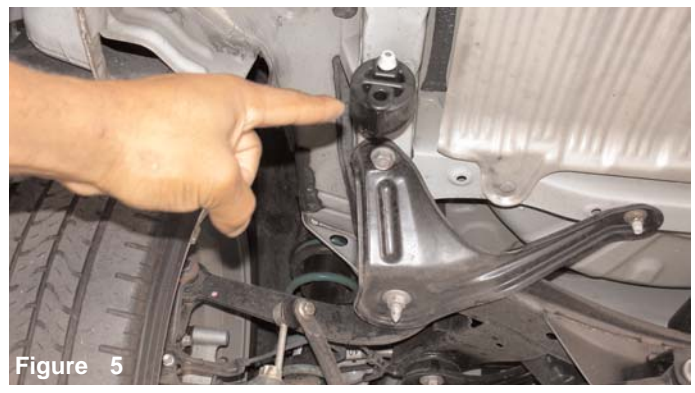
Remove the donut or grommet from the stock hanger located on the driver side rear axle.