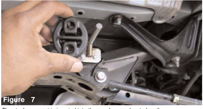
The stock grommet is inserted into the new hanger \, located on the passenger side rear axle.