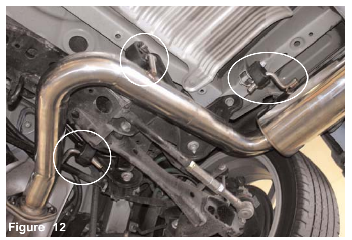
All three muffler hangers are now hanging on all three grommets.