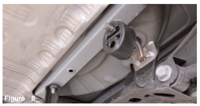
Bottom view of the new grommet location.