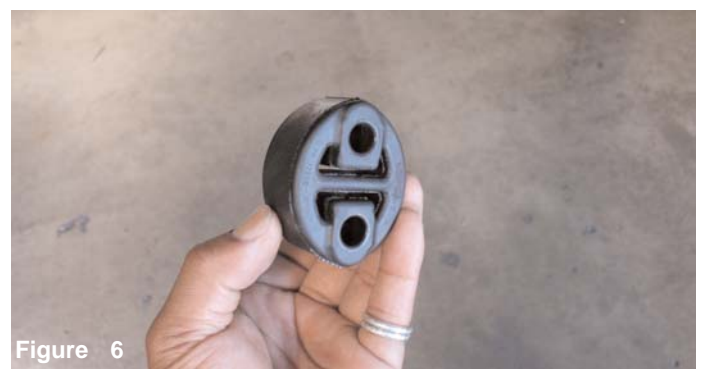
Donut or grommet removed from the stock rear hanger.