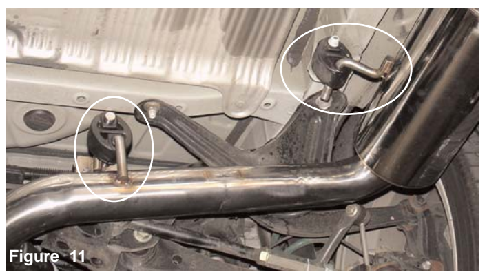
Insert the remaining two hangers into the two grommets as shown above.