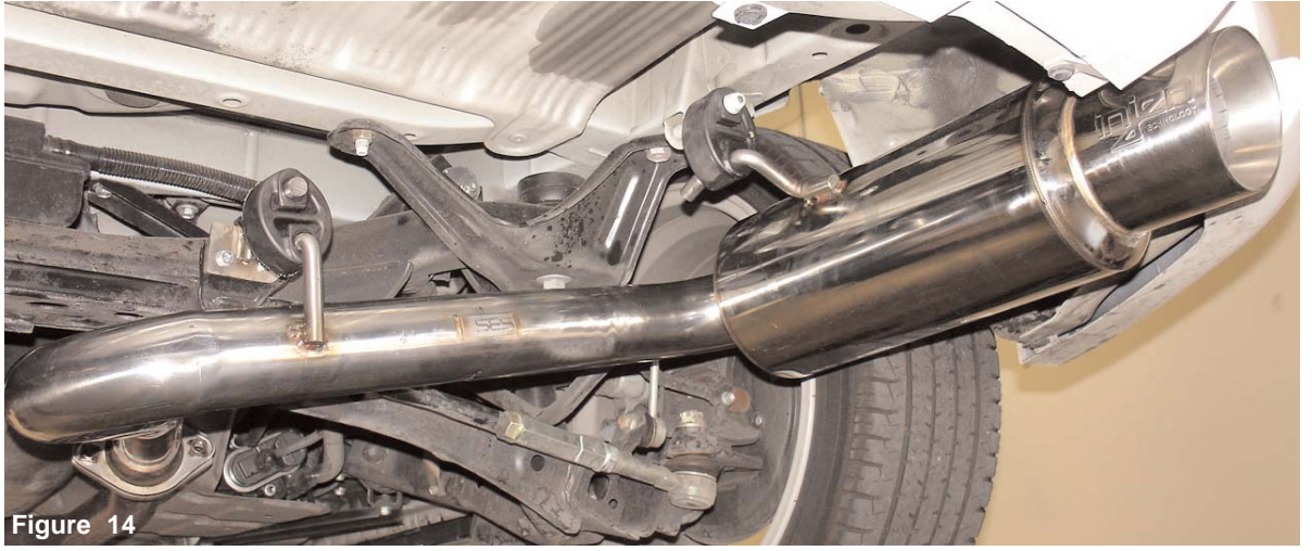
Congratulations! You have just completed the installation of this axle-back exhaust system. Periodically, check the fitment of the exhaust system, be sure that the exhaust still continues to hang in the same position.