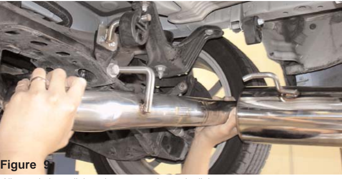
Align and place all three hangers underneath all three grommets.