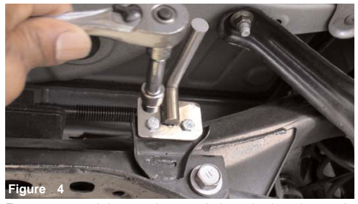
The two m6 x 16mm bolts are used to secure the hanger bracket to the rear axle brace. This hanger bracket is fastened on the passenger side rear axle.