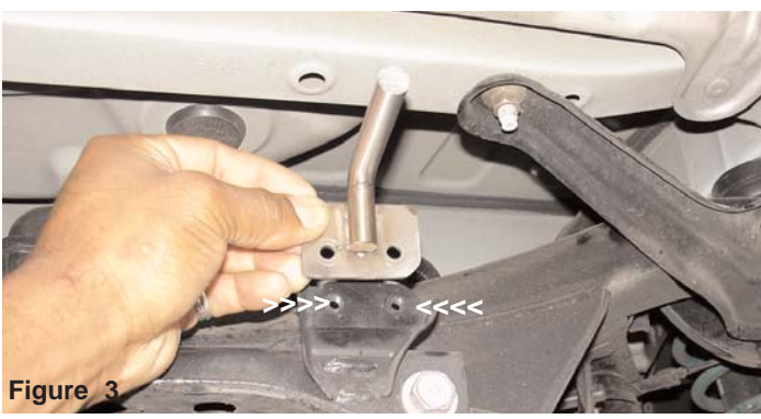
Holes are lined up to the pre-drilled holes on the rear axle brace.