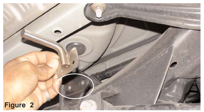
Place hanger bracket against the stock brace located along the rear axle