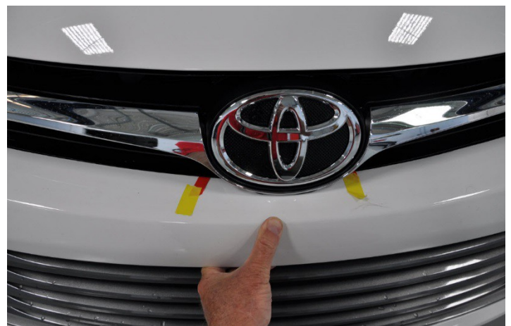
6. 1. Align the overlay to the center by putting the overlay emblem cut out under the emblem and back flush with the grille. Keep overlay at the angle that prevents center long strip from making contact with the bumper. 2. After overlay is centered and pushed back tight against the factory grille, concentrate on lining up top corners first.