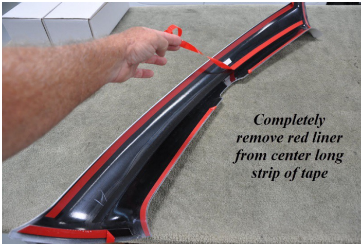
4. Completely remove red liner from center long strip of tape as listed above.