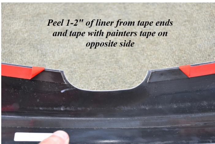
5A. Peel 1-2" off liner from tape ends and tape with painters tape on opposite side as listed above.